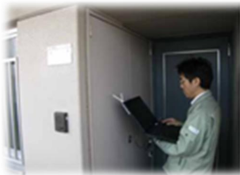
WiMAX testing in an actual meter box

WiMAX module is mounted on a conventional meter, which is not a WiMAX embedded smart meter.