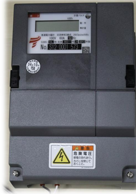
WiMAX embedded Smart Meter developed by KDDI