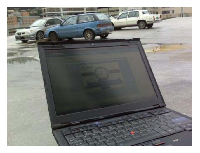
Figure 3. Top floor in parking garage