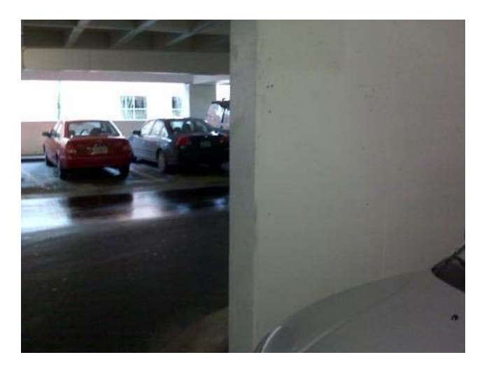
Figure 2. Indoor location at parking garage

At the parking garage, I tested throughput at multiple floors and locations within each floor (Figure 5). As expected, the highest throughput was on the rooftop and near the outside walls. Throughput at deep-indoor locations was tested right behind thick cement walls, at multiple locations.