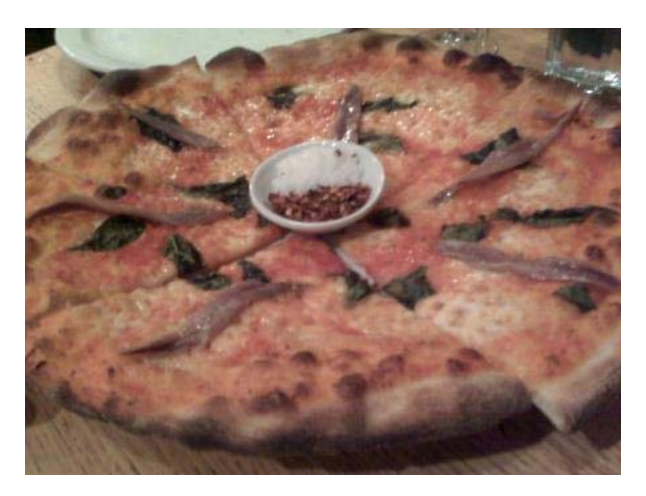
Figure 6. Reward at the end of the day

(although the laptop could detect the presence of the Clear network). Too bad, but at least I was able to enjoy one of the best pizzas (Figure 6) in the US without being distracted by work!